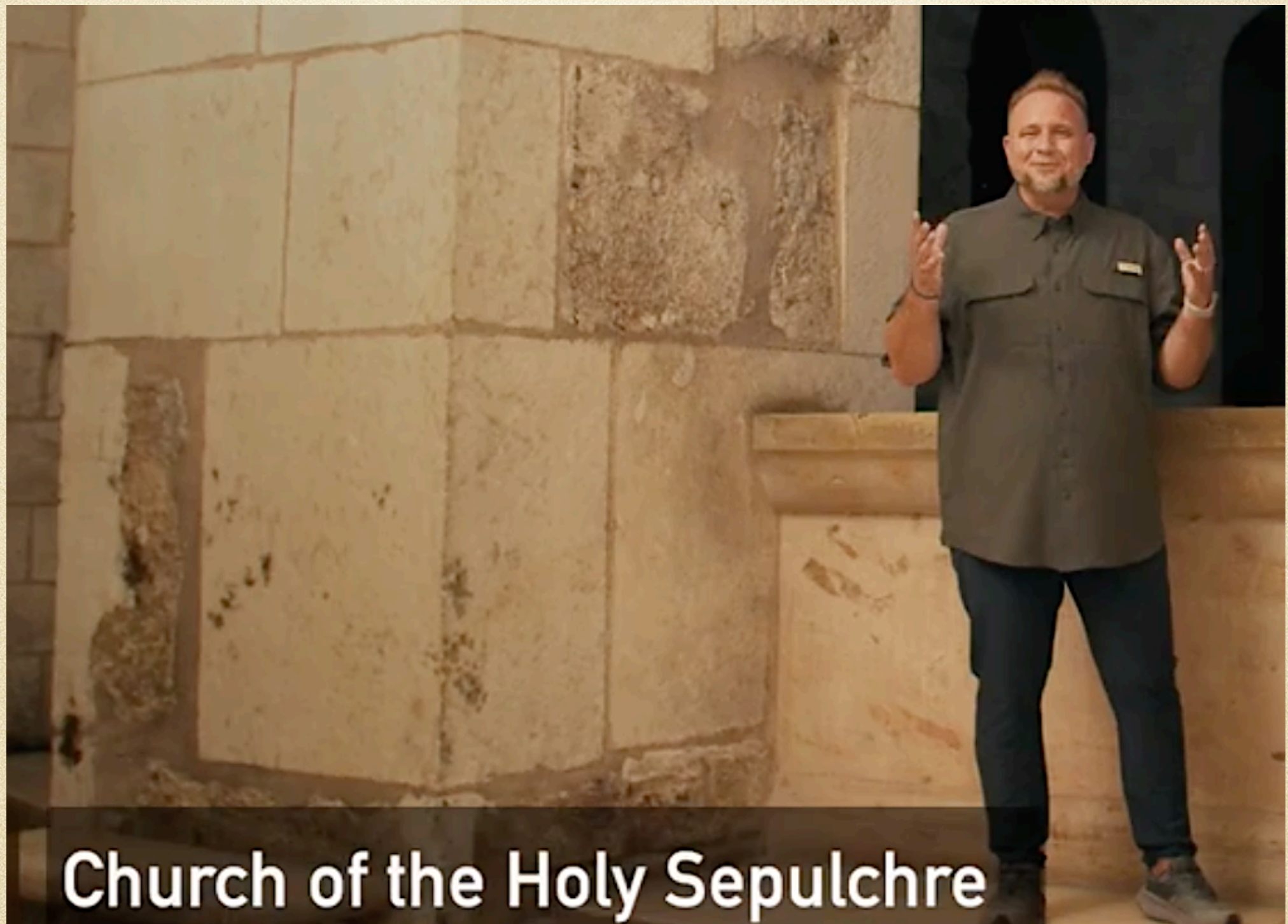
Church of the Holy Sepulchre