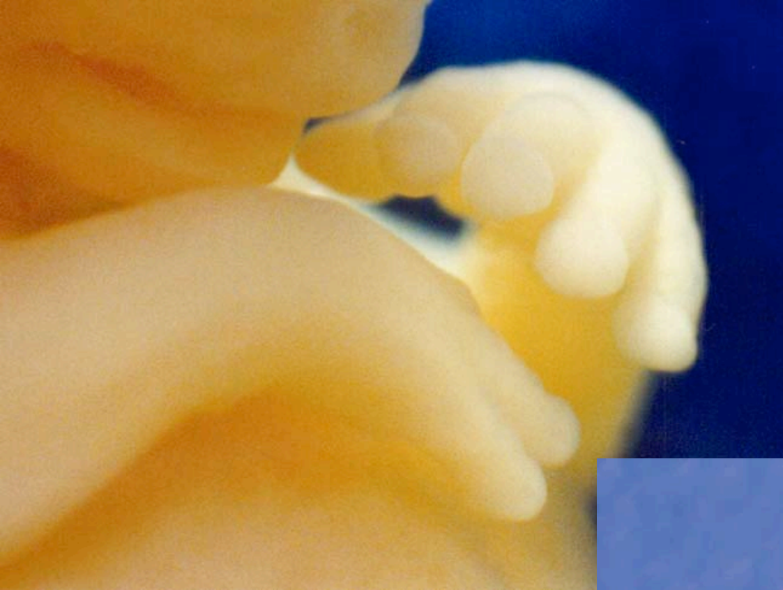
Baby at 7 weeks